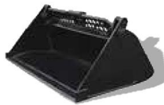
4in 1 Bucket